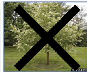
Amur Chokecherry ( Prunus maackii ) Showy white flowers and beautiful copper-colored exfoliating bark. Produces small black fruits that can be used for jams or jellies.

Other varieties for Alaska: M.x ranetka, M. x 'Selkirk'